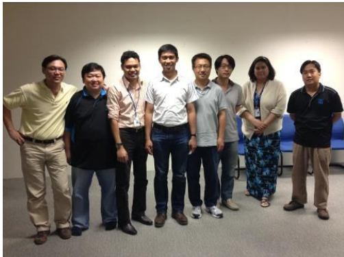
MOM Occupational First Aid 3-5 Sept 2012

We are pleased to announce our first training course for Occupational First Aid course on the 3 - 5 Sept 2012. We are glad that the delegates have learned valuable information and have equipped themselves with the knowledge to perform better in their workplace.