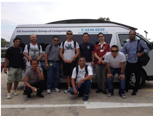
KBAT, DMTR, 27 - 31 Aug 2012