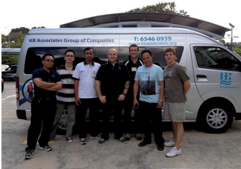
KBAT, DMTR, 24 - 28 Sep 2012