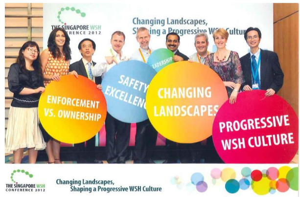
Photo-taking session at the WSH Conference - IOSH UK Team and IOSH Singapore Branch members