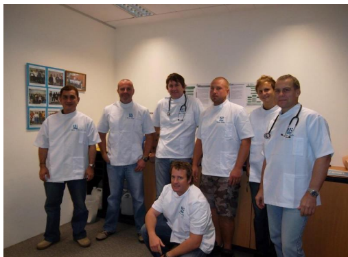
KBAT, DMT, 13 - 24 Aug 2012