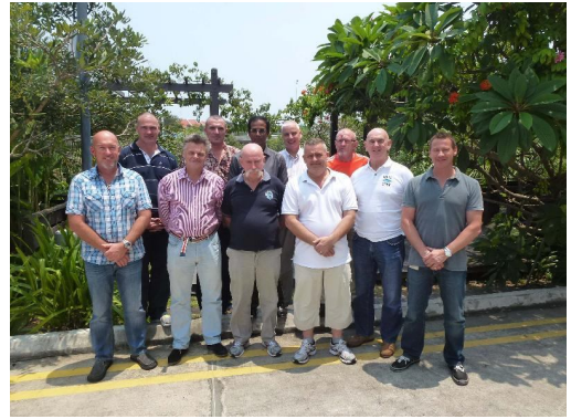
OGP Training on 20 - 24 Aug, Singapore

Looking forward to understand the roles and responsibilities of a CSR as outlined by industry guidance documents issued by Oil & Gas Producers (OGP) and International Marine Contractors Association (IMCA) as well as on the legislative requirements due to area of operation; check out our upcoming schedule on the 29 Oct - 02 Nov in Louisiana, USA. These courses can be provided as an 'in-house' training program or open course, contact us for more details. Click Here for the flyer