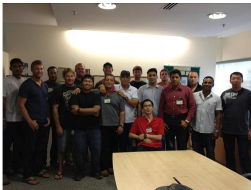
KBAT, DMTR, 9 - 13 Jul 2012