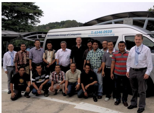
KBAT, DMT, TOTAL Indonesia - 4- 13 Sept 2012

We were glad to have TOTAL Indonesia - a total of 12 delegates in Singapore to have their DMT training with us. Throughout the 10 days training, delegates were trained in different medics's emergency scenarios to enable them to react and respond quickly to real life situations. They were also taught on the pre hospital care medical procedures which will help to enhance their knowledge and put into practice.