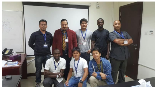
DMT, UAE (13 - 22 Dec 2015)