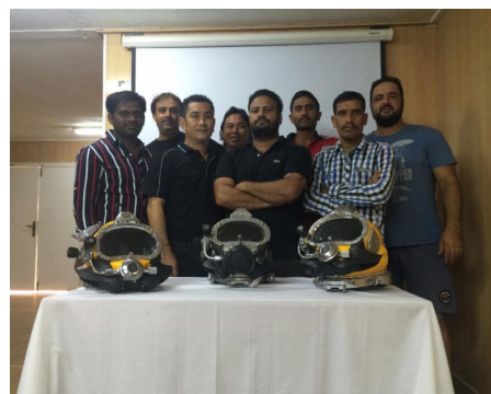
KMDSI Hat Course (14 - 15 Nov 2015)