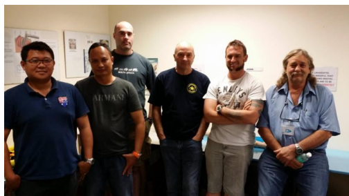
DMTR Singapore (26-30 Oct 2015)