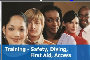
Training - Safety, Diving, First Aid, Access