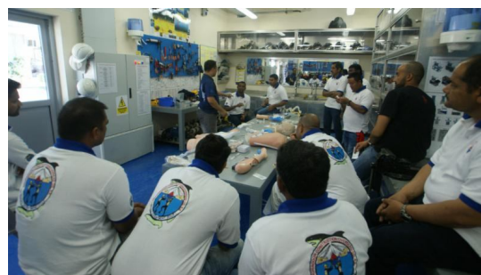
DMTR, UAE (14 - 18 Nov 2015)