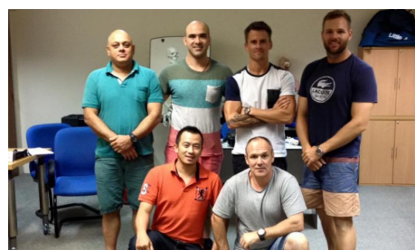
DMT, Singapore (30 Nov-11Dec 2015)