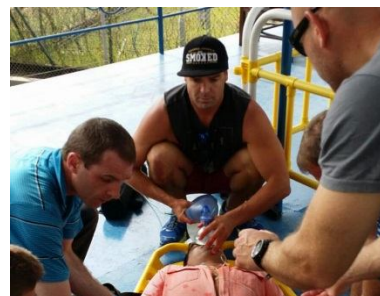
DMTR, Singapore (09 -13 Nov 2015)