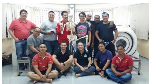
DMTR, Malaysia (23 - 27 Nov 2015)