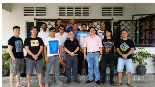
DMTR, Malaysia (16 - 20 Nov 2015)