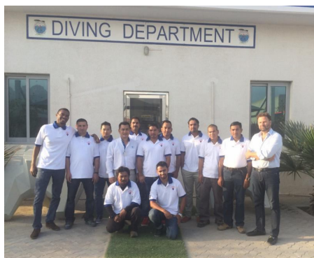
KMDSI Hat Course (11 - 12 Nov 2015)

KBA Training conducted an in-company Kirby Morgan DSI Helmet training for clients in UAE and Saudi Arabia. The next training for 2016 will be held in Singapore on 22 - 24 February or 14 - 16 March 2016. Click Here for the flyer.