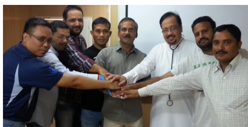
DMT, Saudi Arabia (03 - 12 Nov 2015)

The next training will be held in Singapore on 15 - 26 Feb 2016. Refreshers are scheduled in UK , Chichester on 01 - 05 Feb 2016. Click Here for the flyer.