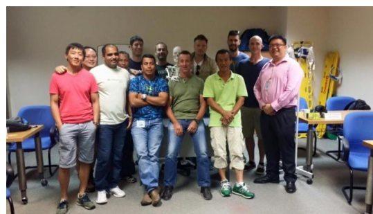
DMTR, Singapore (14 - 18 Dec 2015)