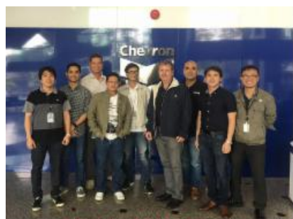
09 - 13 Jan 2017, Thailand