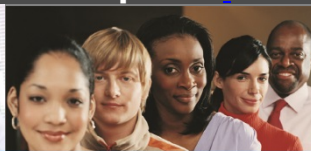
Training - Safety, Diving, First Aid, Access