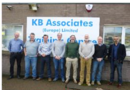
06 - 10 Feb 2017, Aberdeen - UK